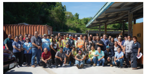
CUC Saipan Water and Wastewater Divisions along with the CUC management team.

While the CUC Saipan drinking water meets EPA's standard for arsenic, it does contain low levels of arsenic. We collected confirmation samples that had lower results and are shown in the table on the previous page. EPA's standard balances the current understanding of arsenic's possible health effects against the costs of removing arsenic from drinking water. EPA continues to research the health effects of low levels of arsenic, which is a mineral known to cause cancer in humans at high concentrations and is linked to other health effects such as skin damage and circulatory problems.